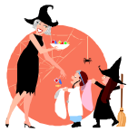
trick or treat